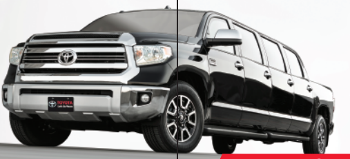
TUNDRASINE CONCEPT VEHICLE