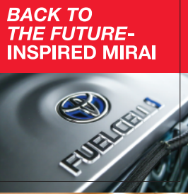
BACK TO THE FUTURE-INSPIRED MIRAI