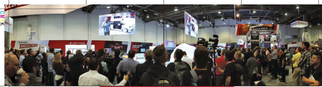
SEMA EDITION TRD VEHICLES